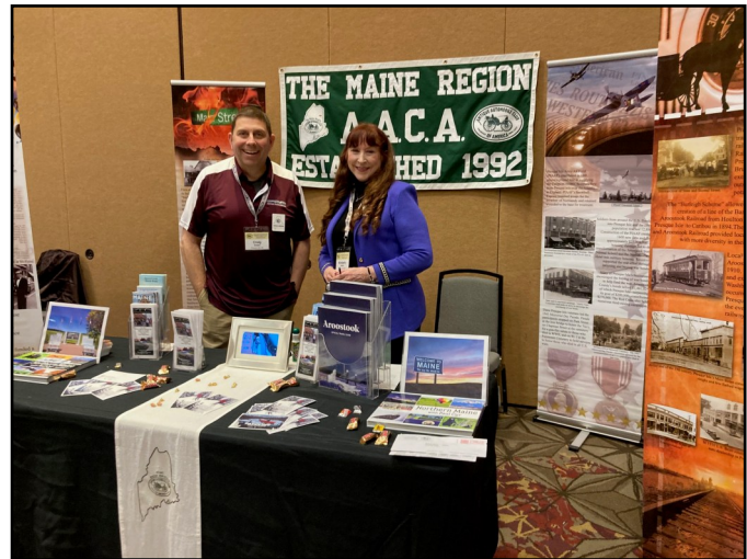
Representatives from AACA Maine Region