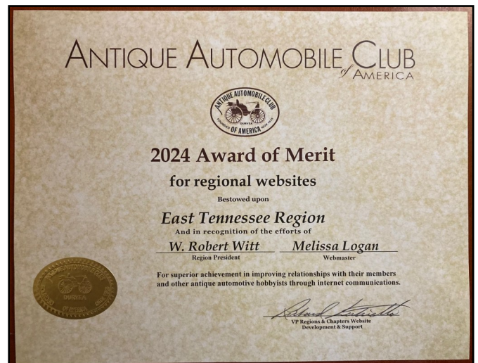
Award of Merit for Regional Websites