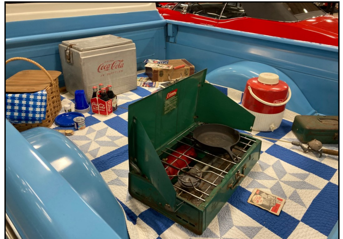
Scott's ready to go camp