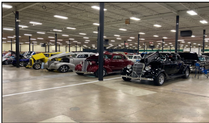
A general view of the show. Most of the models were either modified into Hot Rods or Customized