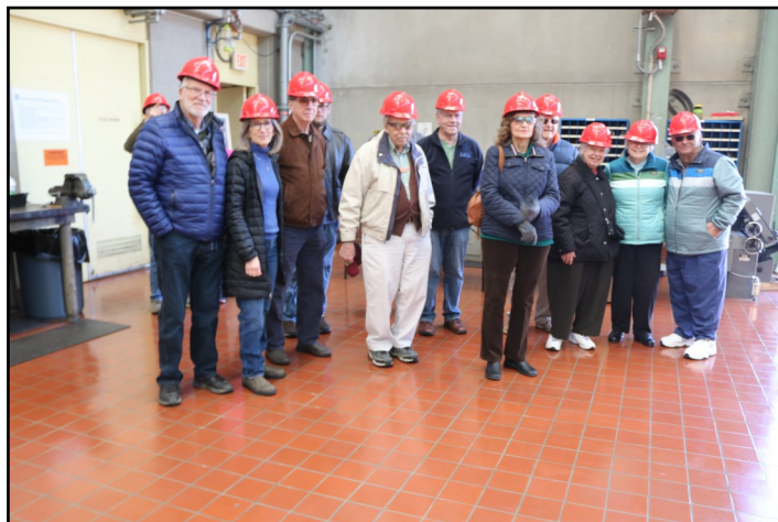
All set up in our Safety Gear, ETR members are ready for the tour of Melton Hill Dam