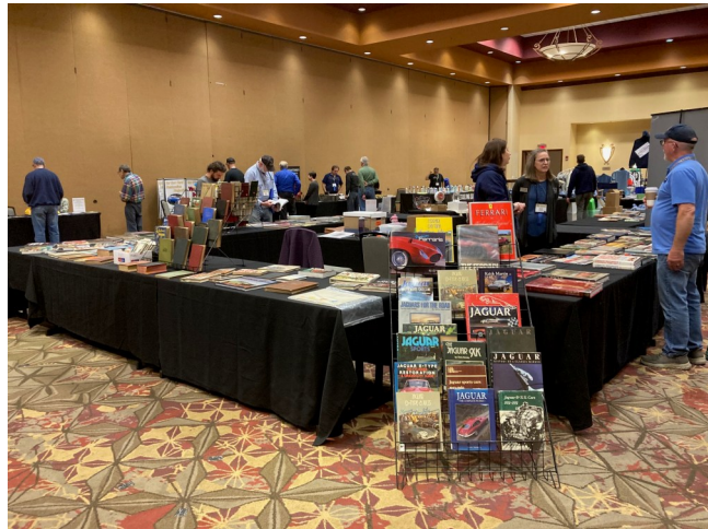
AACA Library and Research Center Booth