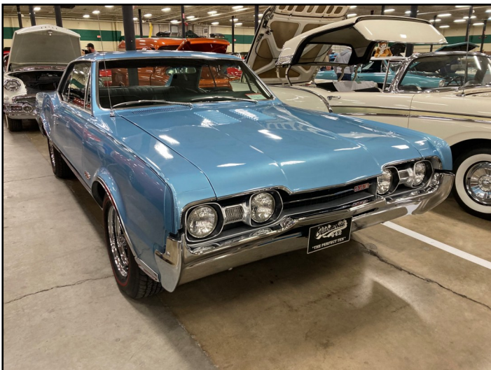
Bill Crisp's 1967 Oldsmobile Cutlass 4-4-2