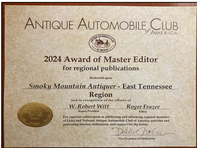
Award of Master Editor for Regional Publications