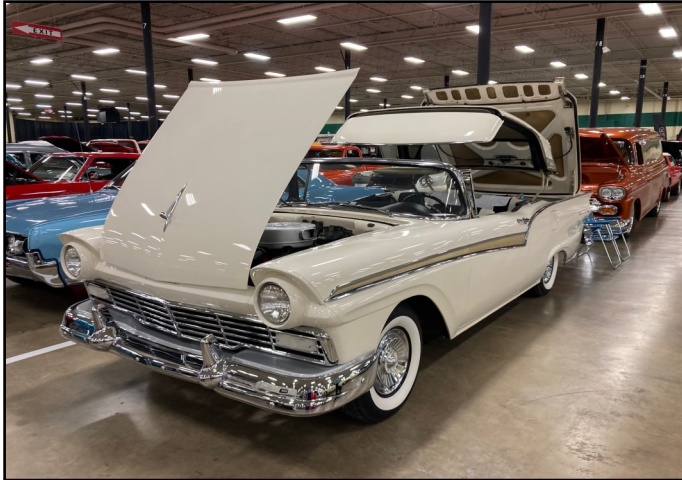
Jim McManus' 1957 Ford Fairlane 500 Skyliner