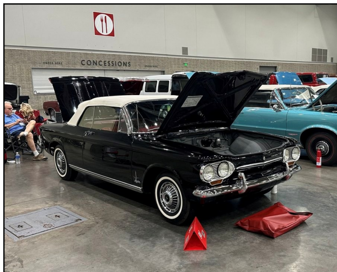
The Frazee's Spyder at the 2024 AACA Fall Nationals in Hampton VA.

The Corvair Ranch in Gettysburg, PA rebuilt the transmission and the differential. I partially disassembled the engine and replaced all worn, broken, or missing parts. I sent the carburetor and turbo charger to Golden Colorado for rebuilding.