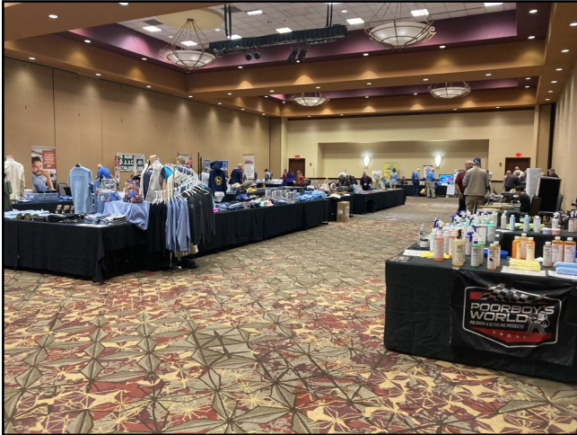
Trade Show—AACA Booth on the left