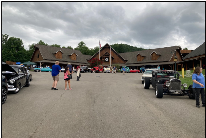
Smoky Mountains Heritage Center in Townsend