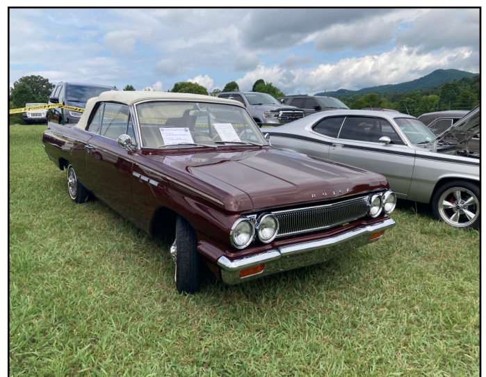
Bob Carter's 1963 Buick Special Convertible