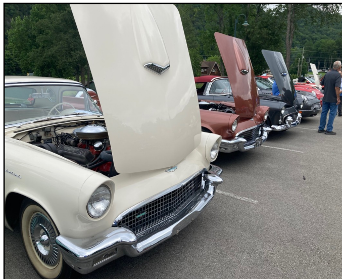
Thunderbird Row ... 1957 and 1956 models