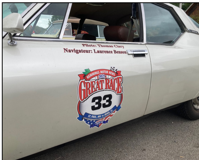
Tom & Larry recently participated in the 2025 Great Race