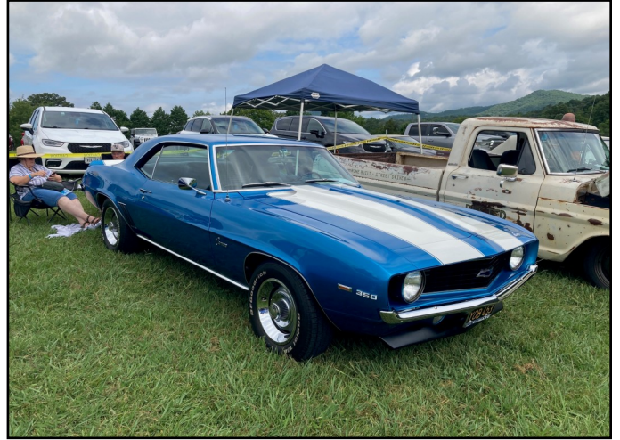
Reid & Anne raithel's 1969 Chevrolet Camaro