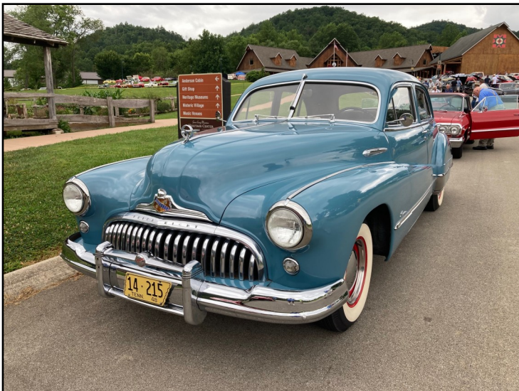
Tracy & Loretta Rollins' 1948 Buick Super