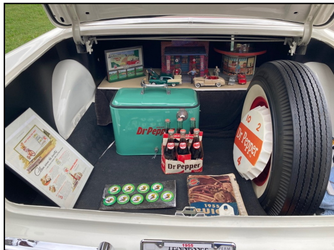
You can always count on Terry for a special display in his Buick