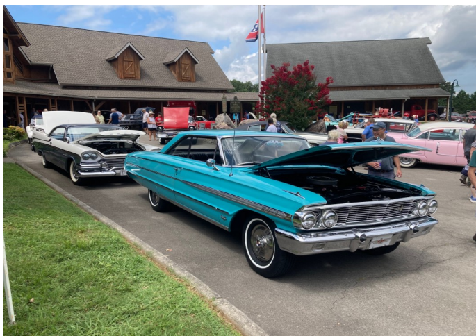
Some of the 124 cars participating