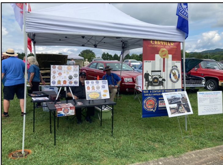
Members of the Walter P Chrysler Club were on hand with special displays commemorating Chrysler's 100th Anniversary