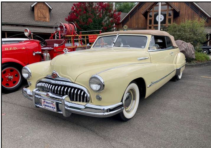
The late Art Fensod's 1948 Buick Super Convertible