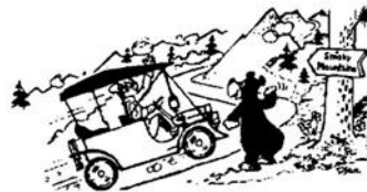
EAST TENNESSEE REGION

The 1916 Ford Model T touring car had been purchased new by the two brothers' Uncle Newt and had not been cranked, much less driven, since 1946. After some persuasion, the brothers agreed to get the old T running in order to haul the guests to the festival.