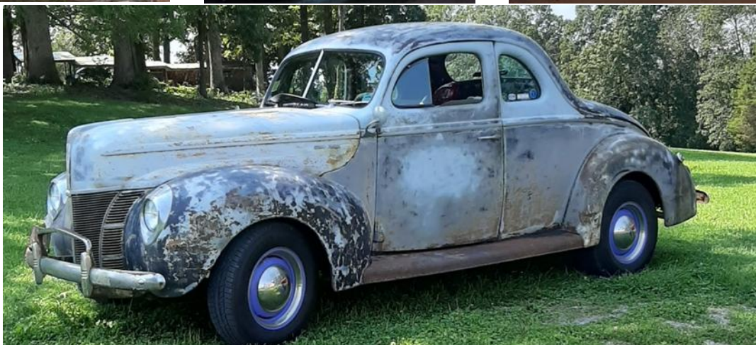
"THE GRAY GHOST"