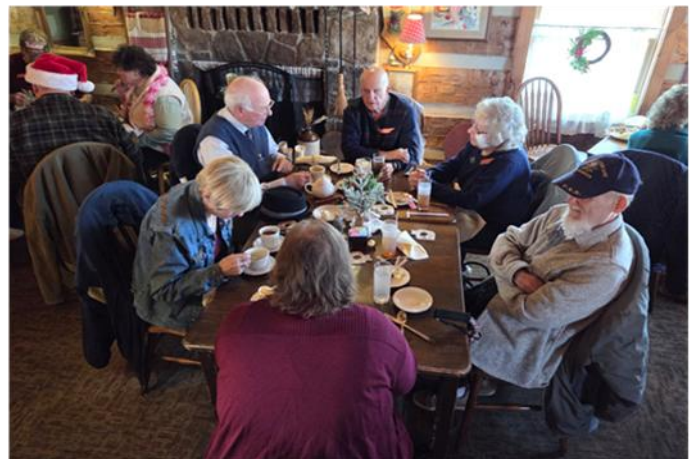
ETR Monthly Breakfast December 11 - Apple Cake Tea Room, Farragut - 29 attending