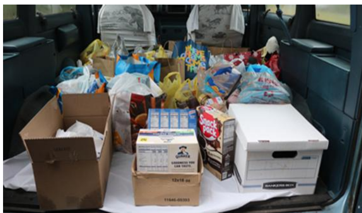
Donations loaded to deliver to Connecting Hearts in the Quillins' 1992 Chevy Astro Van