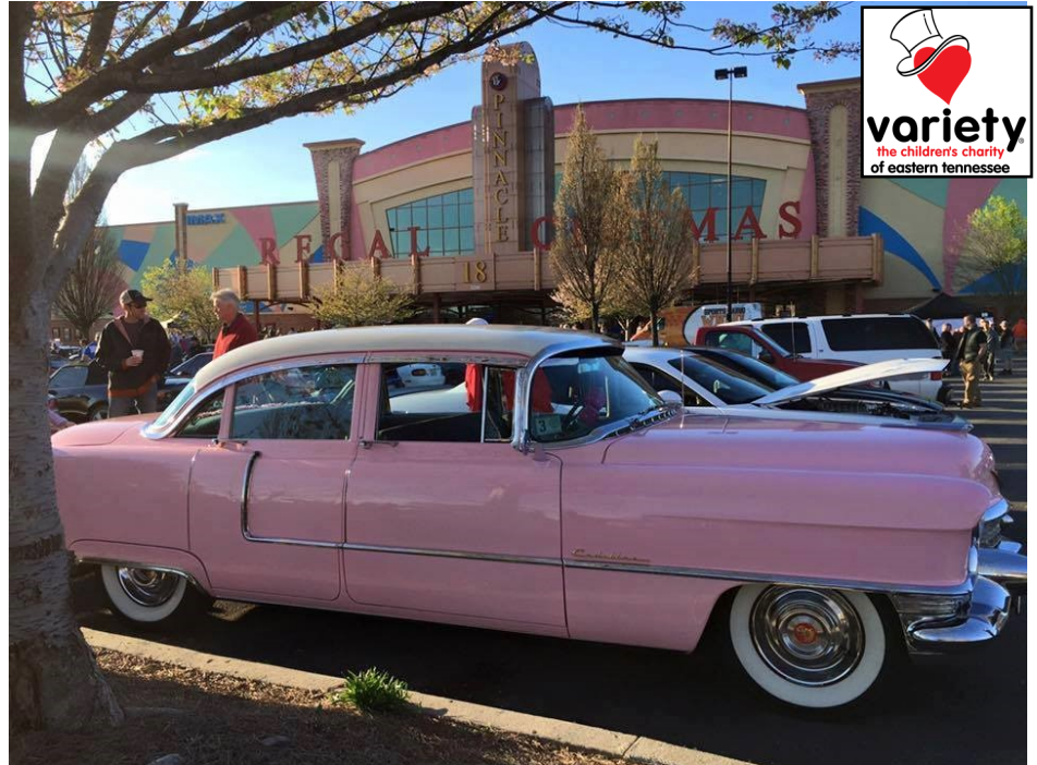
More than 500 cars were on display at the October Variety Cars and Coffee event. The next Cars and Coffee is on April 1.

The event is free to both participants and spectators. Funds are raised through donations and a charity auction.