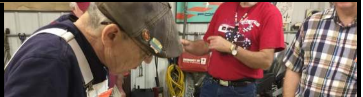
May 18: Tech Day at Paransky Machine and Fabrication