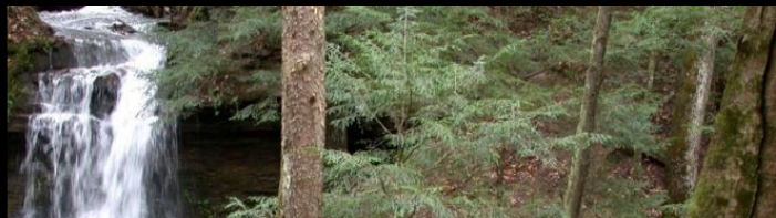
May 11: Tour and Cookout at Frozen Head State Park