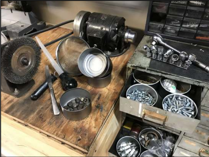
Kitchen utensils and tuna fish cans complement the tools and machinery in a well-equipped shop.

An lesson that gearheads and their significant others learn early during household co-habitation is that kitchen utensils, no matter how suited they may be for the job at hand, must never be taken from the house to the garage. Violating this basic tenant of a relationship can disrupt the harmony that is essential to peace in the home.