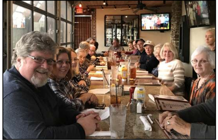
ETR members and guests enjoyed a great dinner at Holstons.

The show featured many of Red’s famous puns, pantomimes, and characters, including Gertrude and Heathcliff, Clem Kadiddlehopper, of course, Freddy the Freeloader.