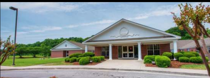
June 15: Car Display at Huntsville Health and Rehabilitation Center