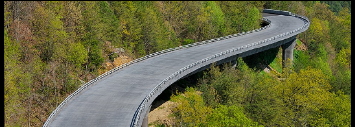
June 22: Foothills Parkway Driving Tour