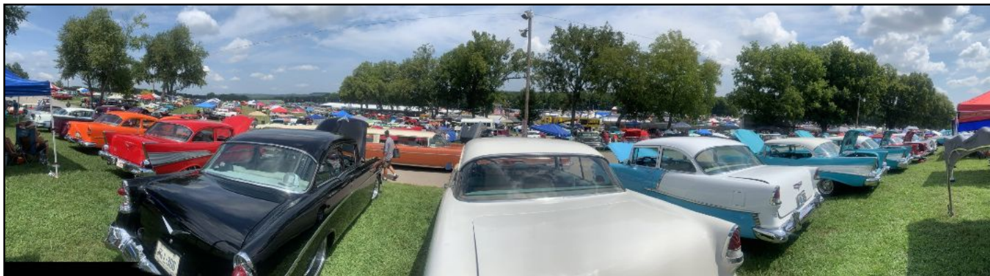
Nearly 3,000 classic Chevys attended the Danchuk Tri-Five Nationals in Bowling Green, Kentucky.