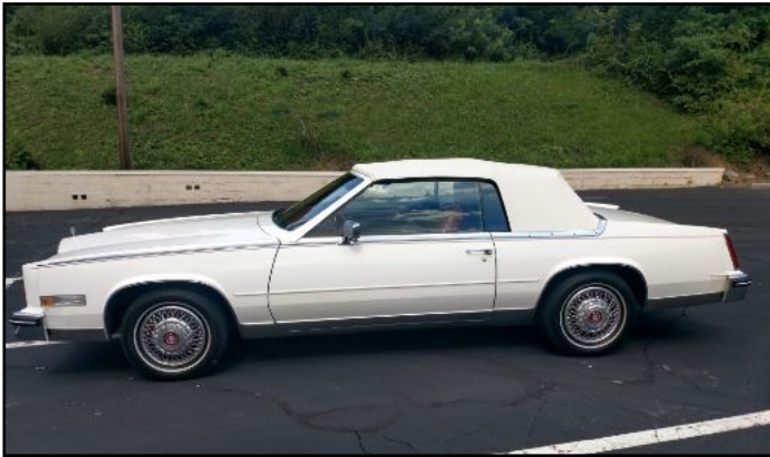
This '85 Eldorado Baritz has been driven just 41,516 miles.

This 1985 Cadillac Eldorado Biarritz convertible is one of 2300 made that year and has been driven just 41,516 miles. Service records available on request.