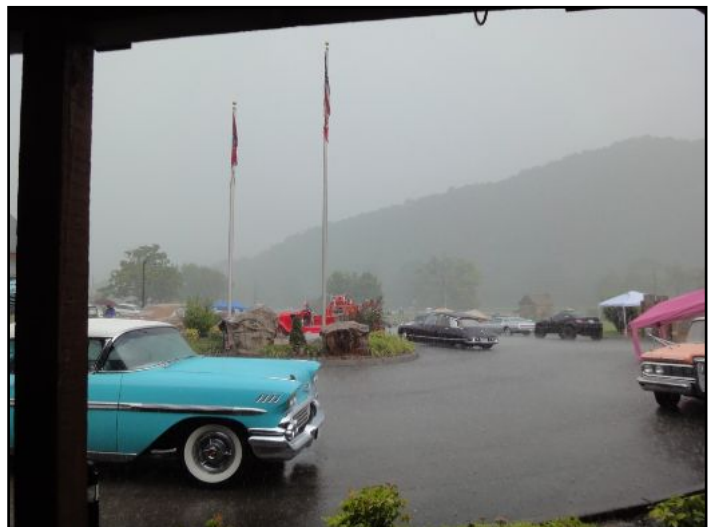
And the rains came.