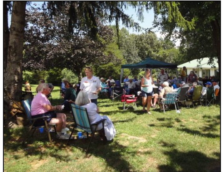
Members and guests relaxed and visited after lunch.