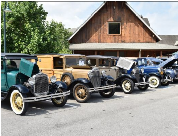
The Smoky Mountain Model A Club made a strong showing.