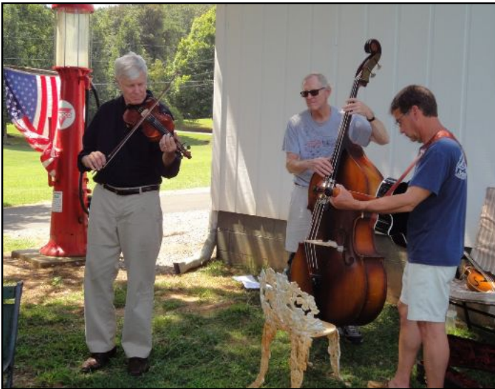
A bluegrass band provided music during the picnic.