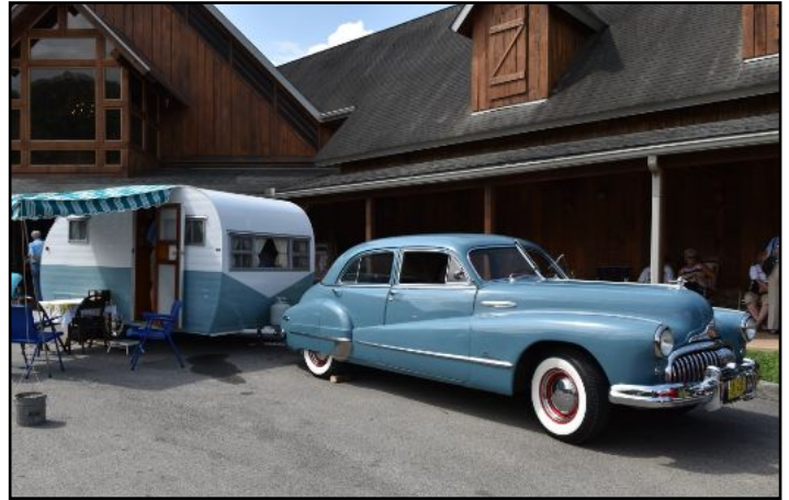
Tracy and Loretta Rollins' 1948 Buick and travel trailer