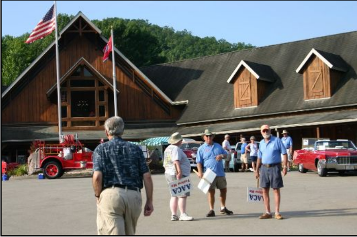
The ETR Parking Committee huddles before the event.