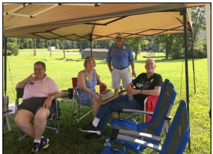
Knoxville Area Corvair Club Members relax under a shade tent.