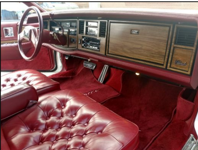
The rich maroon leather interior is in excellent condition.

The car is white on white with a maroon leather interior. It is in excellent condition and has always been garage-kept. A new top was installed in fall of 2018 by Charles Alexander. The convertible top includes a heated glass window.