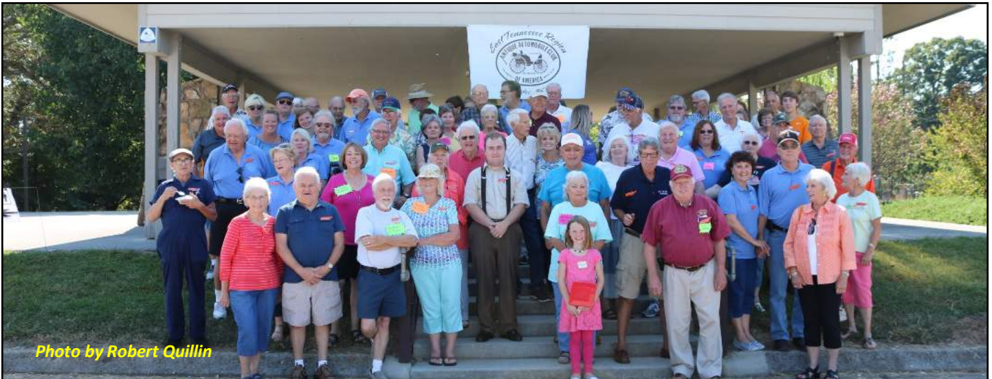
East Tennessee Region members gather at Springbrook Park for Member Appreciation Day.