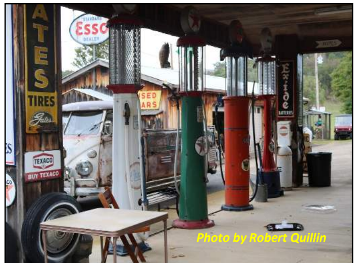
A few of Roger Brown's antique gas pumps