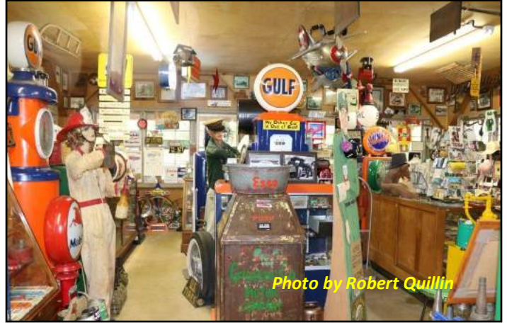
Roger Brown's collection of more than 8,000 automotive antiques