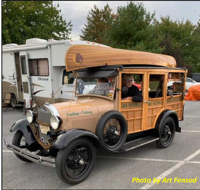
This Model A custom camper arrived at Hershey complete with a beautiful wooden canoe and vintage camping gear.

We established our own traditions such as Amish market visits, favorite restaurants to enjoy, country stores and flea markets